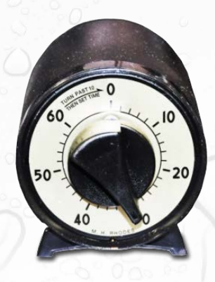
#155-20 - Interval Timer