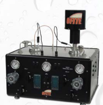
A Single SGSM Unit on a 5,000 PSI Twin Cell UCA