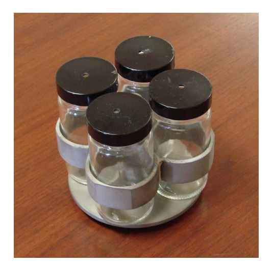
Sample Rack with Bottles