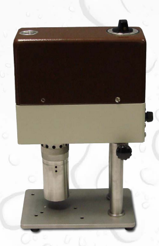
130-10-C-S - Model 800 Viscometer With Carrying Case