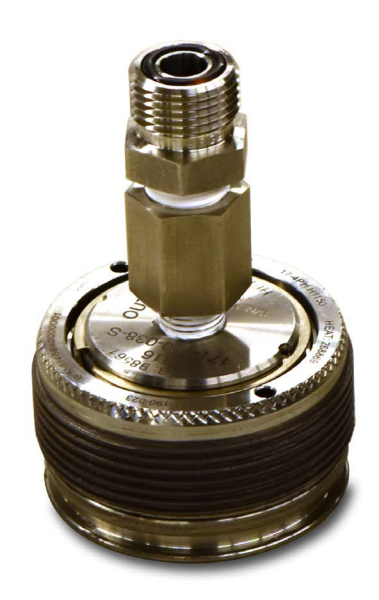
Cell Cap Assembly

4. Connect the LCM Receiver bottom cap assembly (bottom cap, needle valve, and female VCO fitting) to the male VCO fitting on the cell cap assembly. Make sure the filter is in place inside the receiver bottom cap.