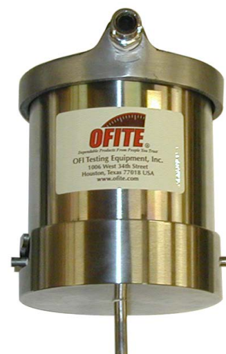
Assembled Test Cell