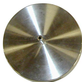
Base Cap (#141-01)