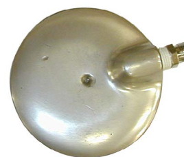
Top Cap (#141-02)